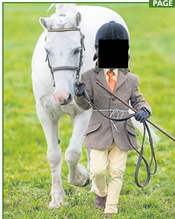
Thousands attend Eggleston Show